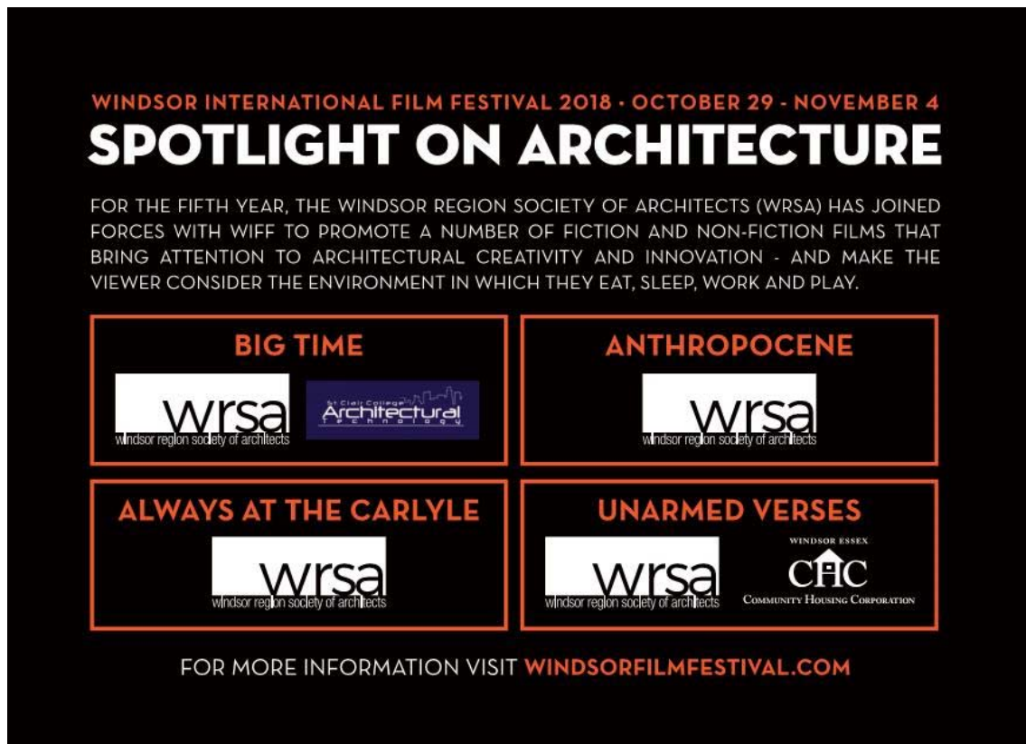
Windsor International Film Festival Spotlight on Architecture