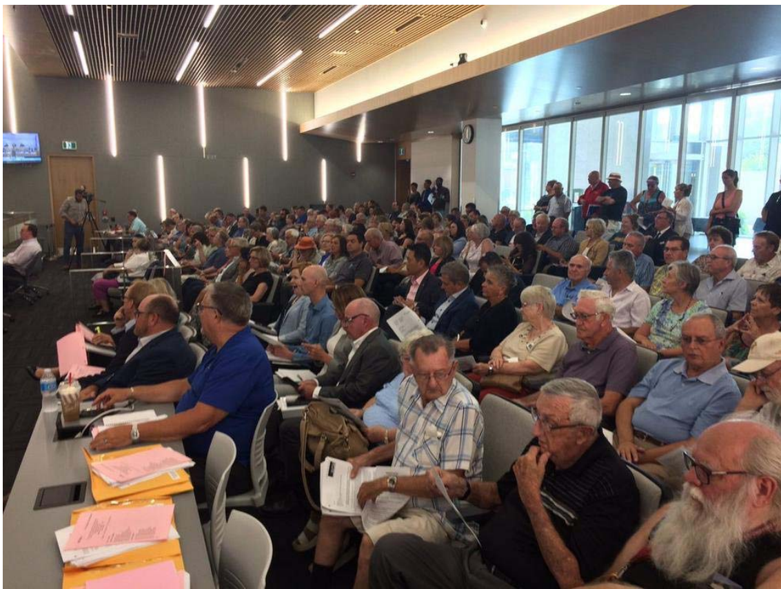
Mega Hospital Rezoning Council Meeting